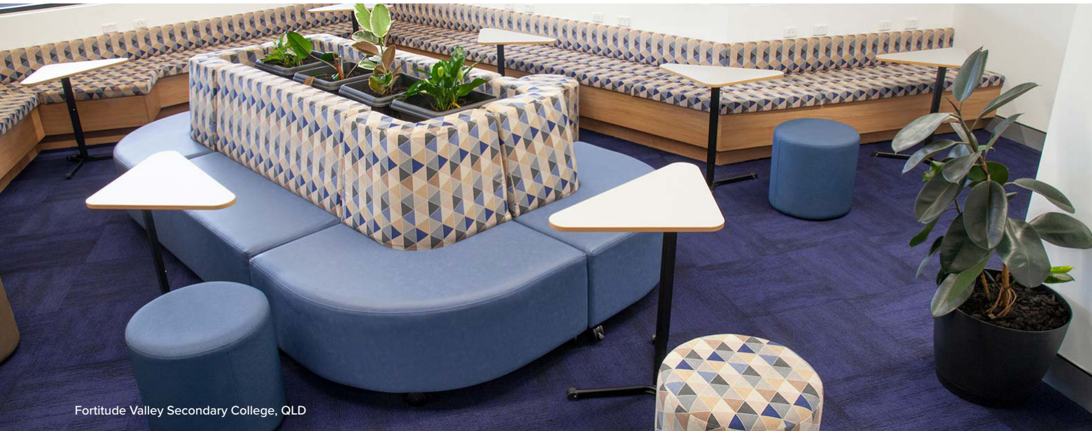
Fortitude Valley Secondary College, QLD

This dependable approach has seen the company approved as a contract supplier to the NSW Government, a preferred supplier of Queensland Government furniture and the sole supplier of Queensland emergency school furniture, under which school fitouts must be provided within days of a fire, flood or other event.